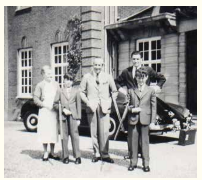
HJ Mulliner Bentley - JACK BARCLAY