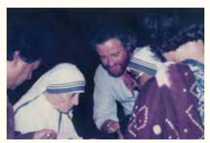
Mother Teresa - India