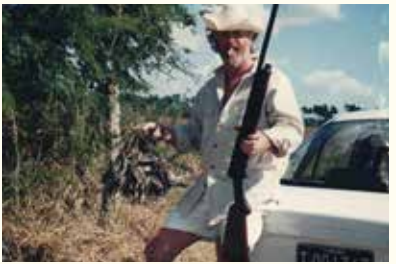
Quail Shooting Cuba '93