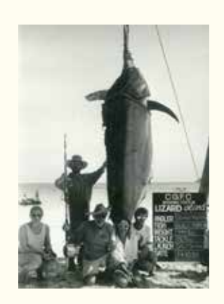
Great Barrier Reef 1985