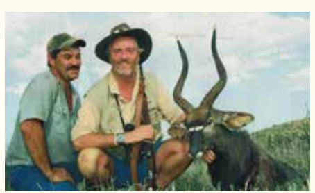
Nyala South Africa