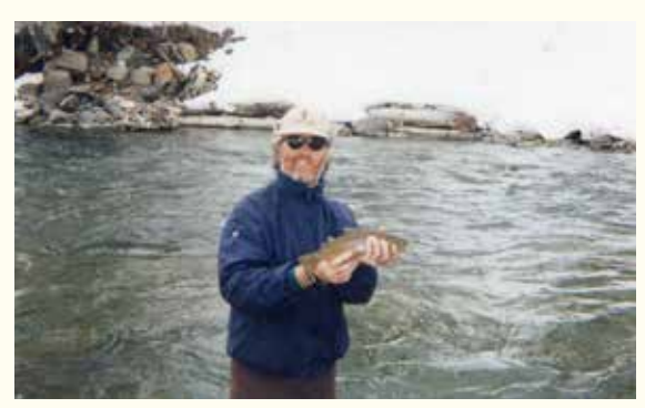
Trout Fishing with Hemingways Sun Valley US