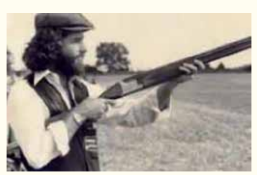
GM - PLAYBOY TEAM

GM FEELS THERE WILL BE MANY COOL PEOPLE TO JOIN A TEAM TO BE ABLE TO COMPETE FOR THE COOLEST CARS ON THE PLANET! GM FEELS MANY SPORTS ORIENTATED SPONSORS SUCH AS DHL AND RED BULL WOULD ALSO BE KEEN TO BE A PART OF SUCH A GOOD CAUSE AS SAVING THE AFRICAN ELEPHANT AND