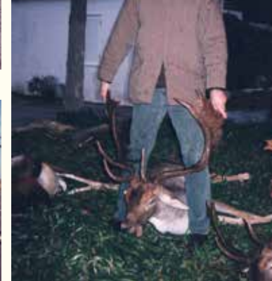
Fallow Buck Germany