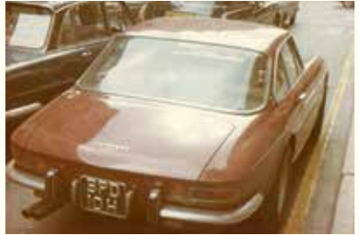
1st Ferrari 365 GTC