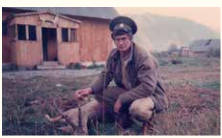
Siberian Roebuck Altai