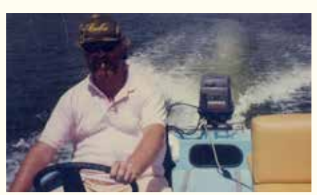
Cuba Fishing for Tarpon