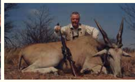
Eland South Africa