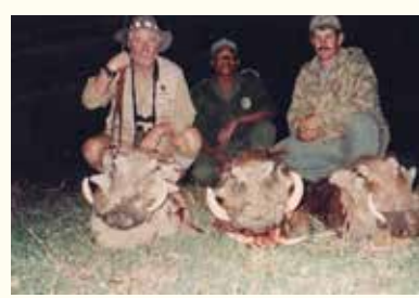
Warthog South Africa