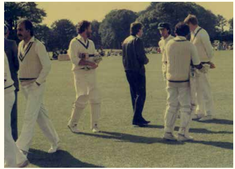
Playing cricket with legend Imran Khan