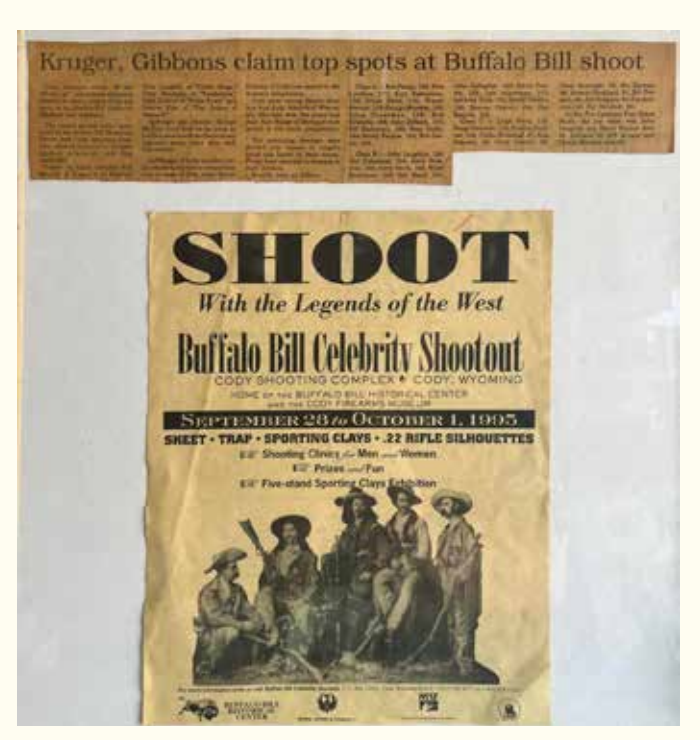
Cody Wyoming Celebrity Shootout

THE LOCAL STARS THEY WISH TO GET IN THEIR SIGHTS. CLAY PIGEON SHOOTING IS A WAY