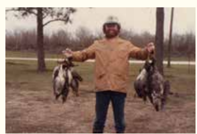
Louisiana Duck Hunting