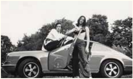
Porsche 911S Daily Mail 1969

AFRICA HAS TO BE STOPPED . GM HOPES THE OUTDOOR CHANNEL WILL ALONE CREATE GOOD AWARENESS FOR THIS IMPORTANT CAUSE .