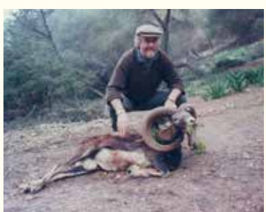
Greece Mouflon #2 in World