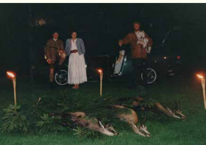
Chamois with Aston Martin Shooting Brake