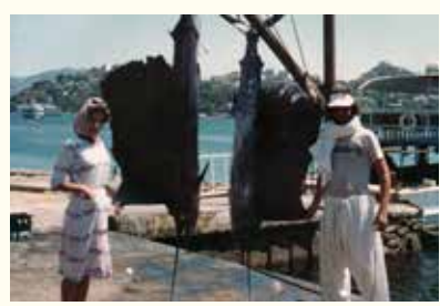
Sailfish - Acapulco