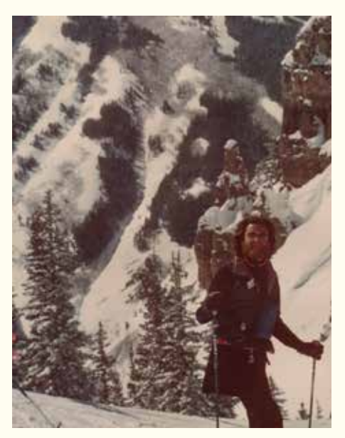
Aspen Skiing 1977

THE LOCAL STARS THEY WISH TO GET IN THEIR SIGHTS. CLAY PIGEON SHOOTING IS A WAY