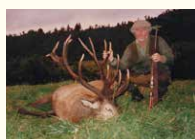
Stag - Chile