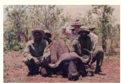
Buffalo - Zimbabwe Safari