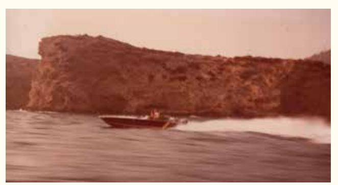
The Whatever Ibiza 1980